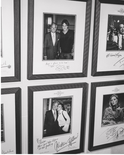
12 © Oliver Pilcher