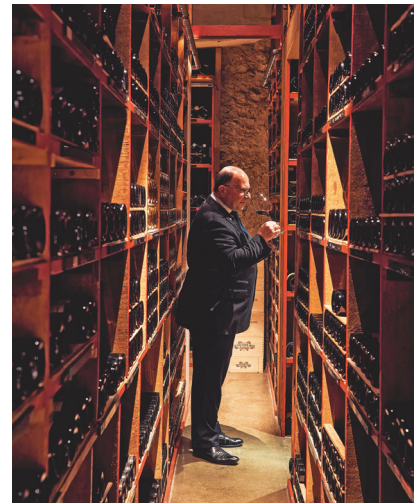
11 © Oliver Pilcher