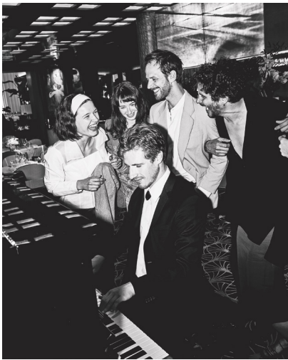
15 © Oliver Pilcher