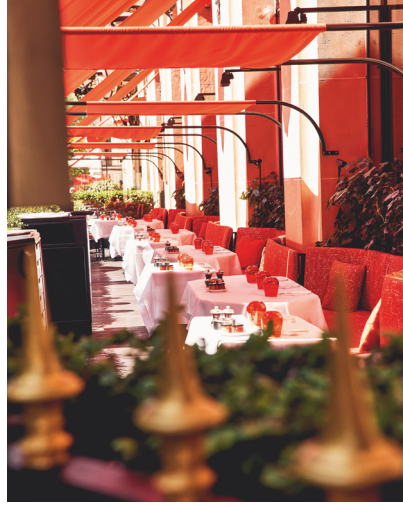
13 © Oliver Pilcher