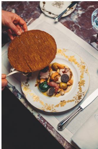
4 © Boby Odieux