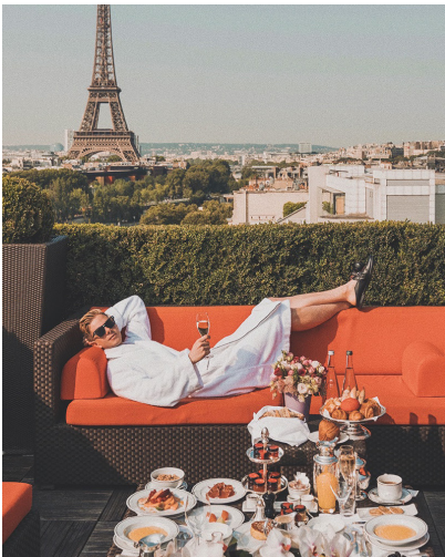
3